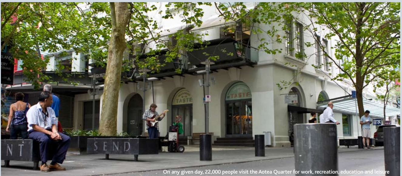
On any given day, 22,000 people visit the Aotea Quarter for work, recreation, education and leisure

The Central Library café was also completed.