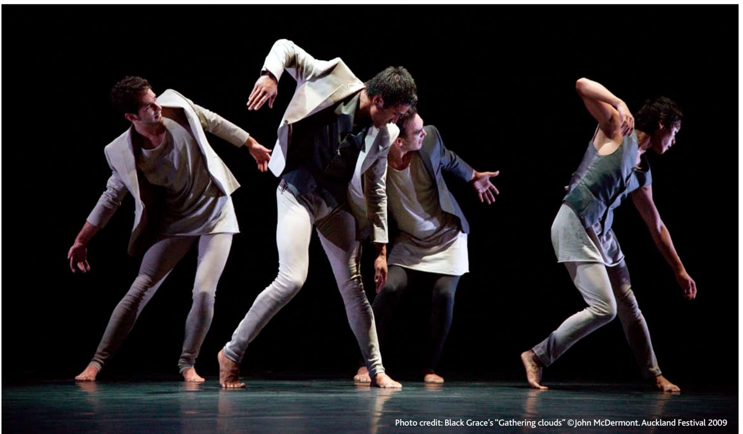
Photo credit: Black Grace's "Gathering clouds" ©John McDermont. Auckland Festival 2009